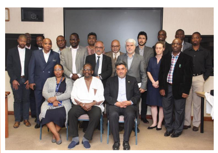
Delegation attending the Iran-South Africa Cultural Dialogue – Colloquium.

In an effort to facilitate cultural and communication exchange between Iran and South Africa in the areas of Science and Art and to discuss cultural commonalities and challenges, the Africa Institute of South Africa of the Human Sciences Research Council (HSRC) and the Department of Arts and Culture (DAC), South Africa and in partnership with the Embassy of the Islamic Republic of Iran in Pretoria, organised a high-level colloquium titled "The Iran-SA Cultural Dialogue", held in Pretoria on 22<sup>nd</sup> – 23<sup>rd</sup> October 2018. The colloquium was aimed at building ties between cultural and research institutions in South Africa and Iran. It was also useful to initiate discussion on a potential partnership between AWHF and the HSRC on areas of common interest such as the Sustainable Development and Youth, in light of the programmes that both institutions already undertake in these fields.