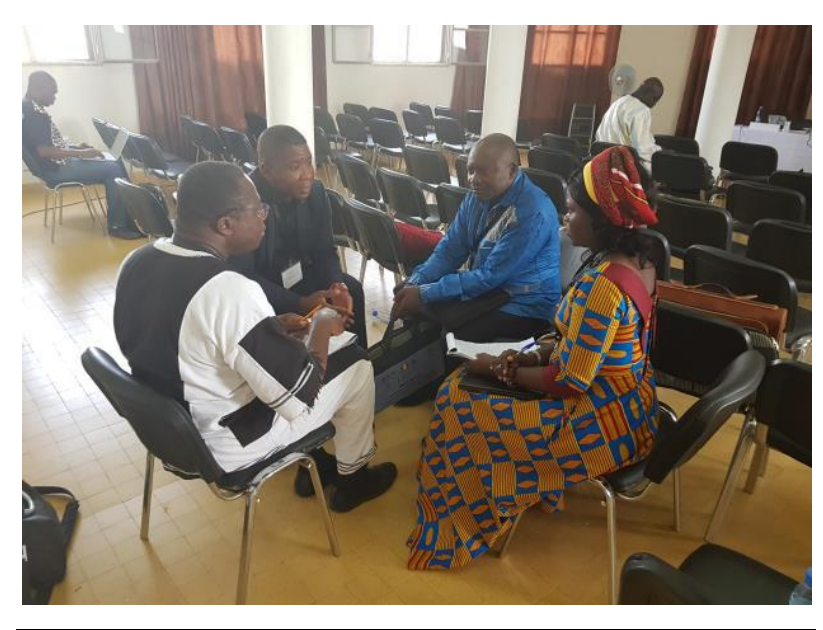
Working session with delegates from ERAIFT based in DRC.

The programme on World Heritage and Educational Institutions in Africa was kicked off at Great Zimbabwe World Heritage Site on 19^{th} - 21^{st} April 2018 with an expert workshop Anglophone,