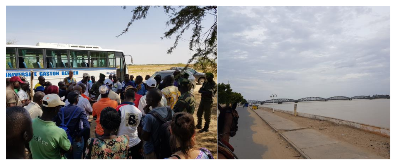
Site visit and briefing session at Djoudj Bird Sanctuary in Senegal (left) & Faidherbe Bridge of Saint Louis (right).

aiming at mapping up the status and discussing perspectives in that field. A third workshop putting together selected Anglophone and Francophone participants will be organised in 2019 to finalize the process of involving universities in World Heritage issues in Africa.