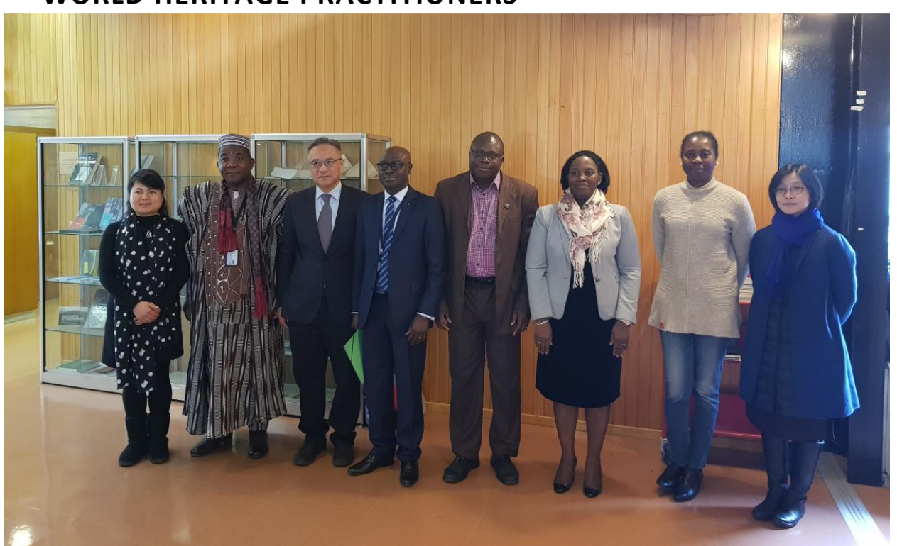
Group photos of Experts with the Permanent/Deputy Permanent Delegate of Burkina Faso to UNESCO (Regional President to the Bureau of the World Heritage Committee).

An expert meeting was organized on 22 <sup>nd</sup> – 23 <sup>rd</sup> November 2018 by the World Heritage Centre in Paris (France) with the purpose to discuss a proposal for a new initiative entitled "China-Africa exchange for capacity-building and knowledge-sharing among World Heritage practitioners".