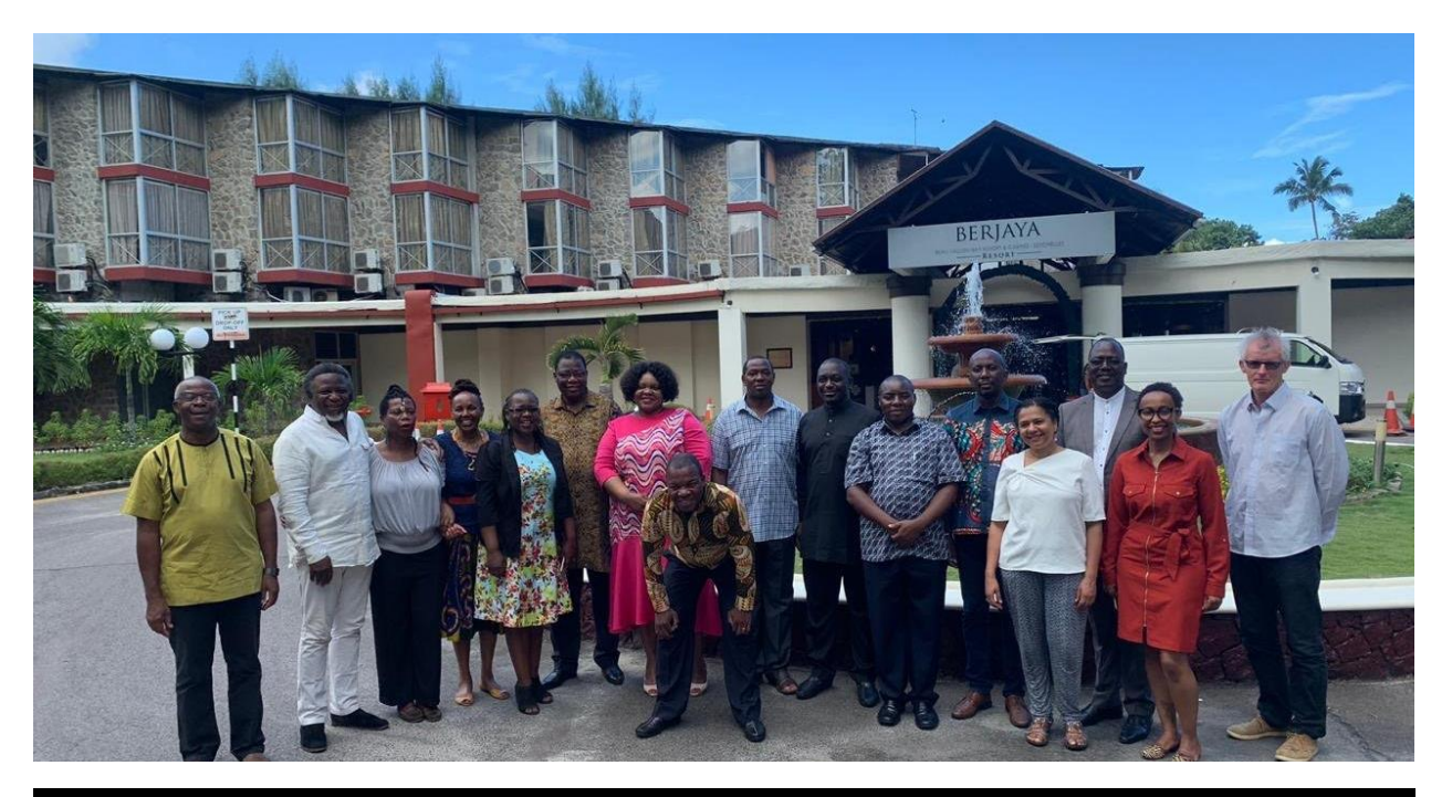
AWHF with the delegation attending the AU workshop on the Continental Cultural Policy.

AWHF was invited to participate at the productive African Union workshop to review the Continental Cultural Policy on the African Creative Economy Sector to include new trends. The workshop took place from 7 <sup>th</sup> – 8 <sup>th</sup> December 2018 at Victoria, Seychelles.